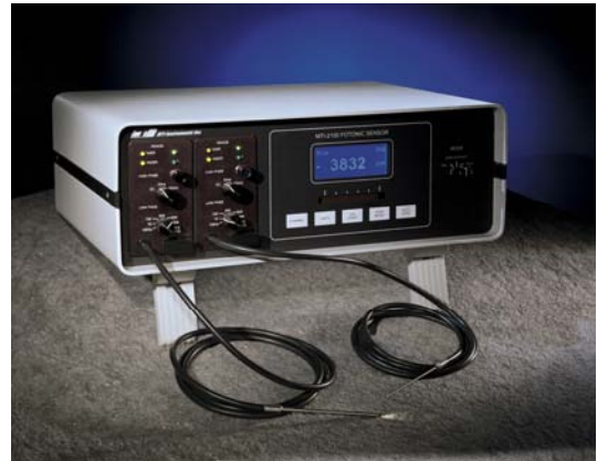
MTI-2100 FOTONIC SENSOR